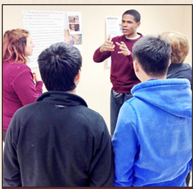
Newsletter — Honors Program

Story originally published by MSU's Office of Public Information.